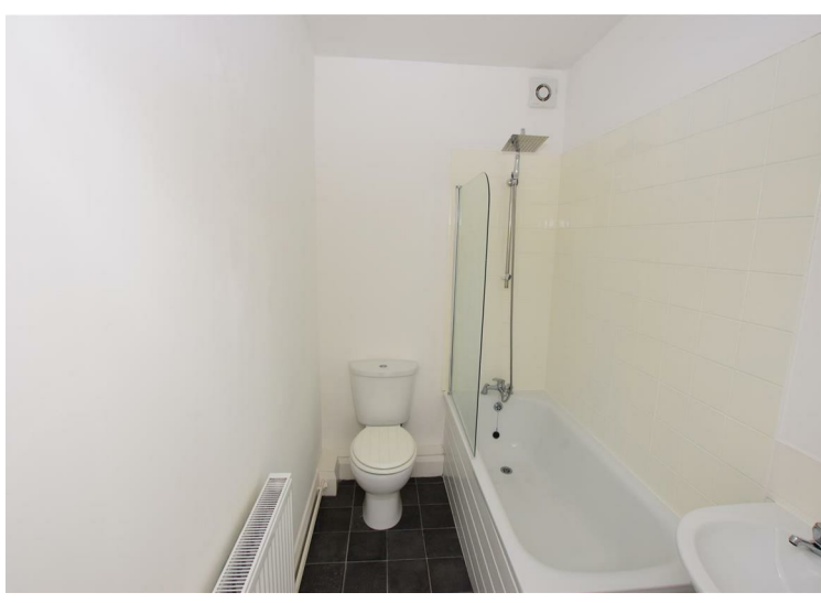
These particulars, whilst believed to be accurate are set out as a general outline only for guidance and do not constitute any part of an offer or contract. Intending purchasers should not rely on them as statements of representation of fact, but must satisfy themselves by inspection or otherwise as to their accuracy. No person in this firms employment has the authority to make or give any representation or warranty in respect of the property.