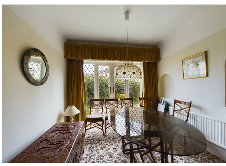
These particulars, whilst believed to be accurate are set out as a general outline only for guidance and do not constitute any part of an offer or contract. Intending purchasers should not rely on them as statements of representation of fact, but must satisfy themselves by inspection or otherwise as to their accuracy. No person in this firms employment has the authority to make or give any representation or warranty in respect of the property.