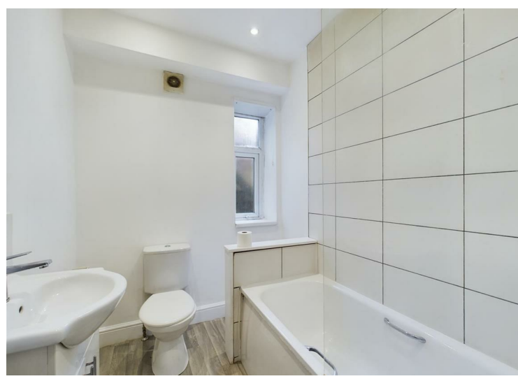
These particulars, whilst believed to be accurate are set out as a general outline only for guidance and do not constitute any part of an offer or contract. Intending purchasers should not rely on them as statements of representation of fact, but must satisfy themselves by inspection or otherwise as to their accuracy. No person in this firms employment has the authority to make or give any representation or warranty in respect of the property.