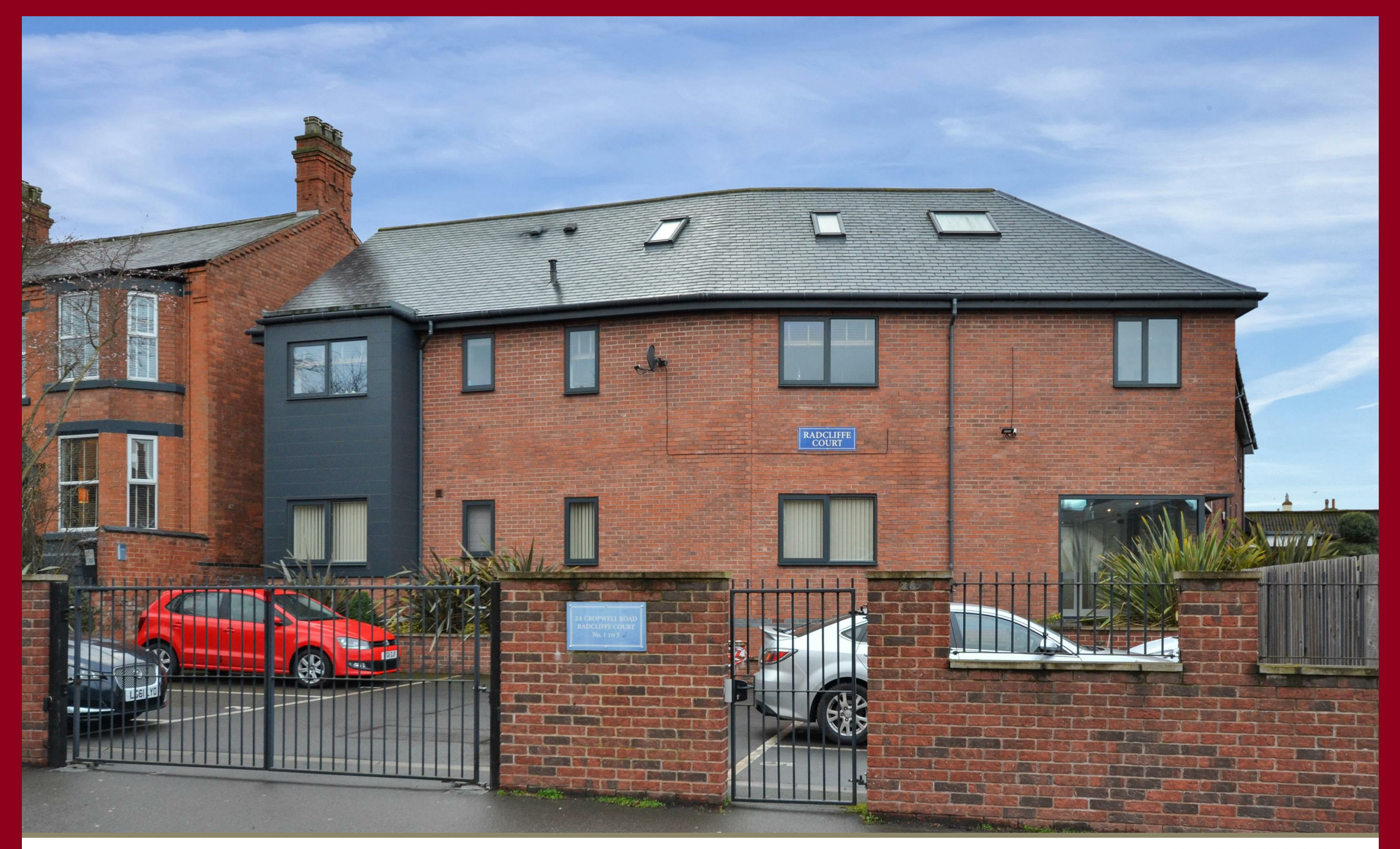
Flat 3 Radcliffe Court 2a Cropwell Road, Radcliffe on Trent, Nottingham, NG12 2FS