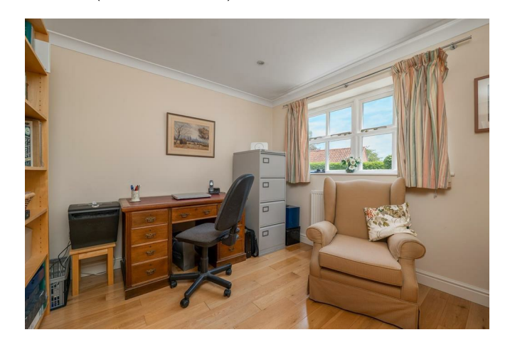
Wood framed double glazed window to front elevation, radiator, oak flooring, coved ceiling, LED downlights.