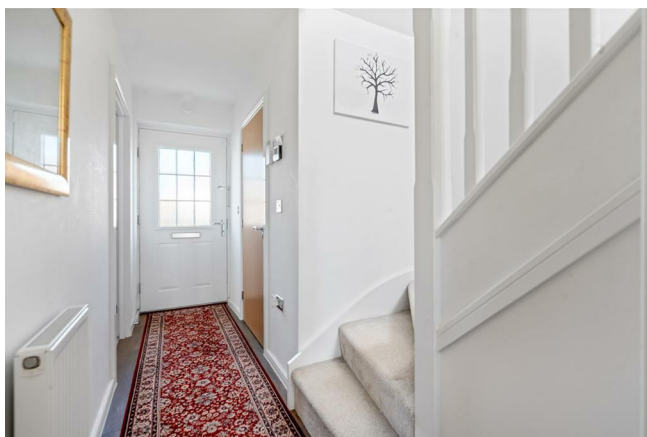
Radiator and staircase to the first floor.