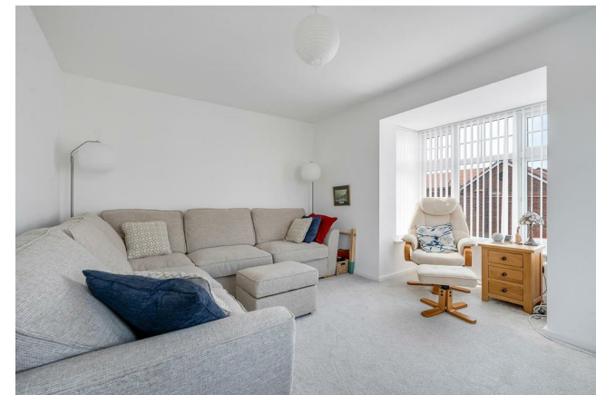
This pleasant room has a dual aspect. Radiator. Fitted blinds included.

14'9 x 10'4 (4.50m x 3.15m) (plus 3' deep bay window)