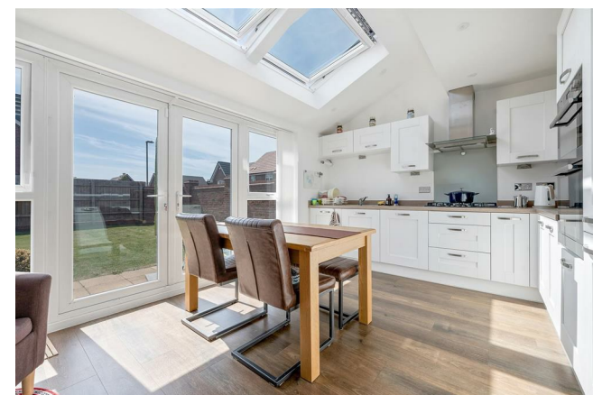
South aspect with opening French doors and window to the garden. Also three Velux roof lights in the vaulted ceiling, fitted with manual sun blocking blinds. Fitted wall units, base units, working surfaces incorporating a gas four ring hob, oven, dishwasher, fridge freezer, pull out storage, splashback and stainless steel extractor. Fitted blinds included.