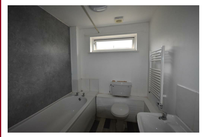
White suite comprising bath, basin and low suite WC. Electric heater. Electric shower over the bath.