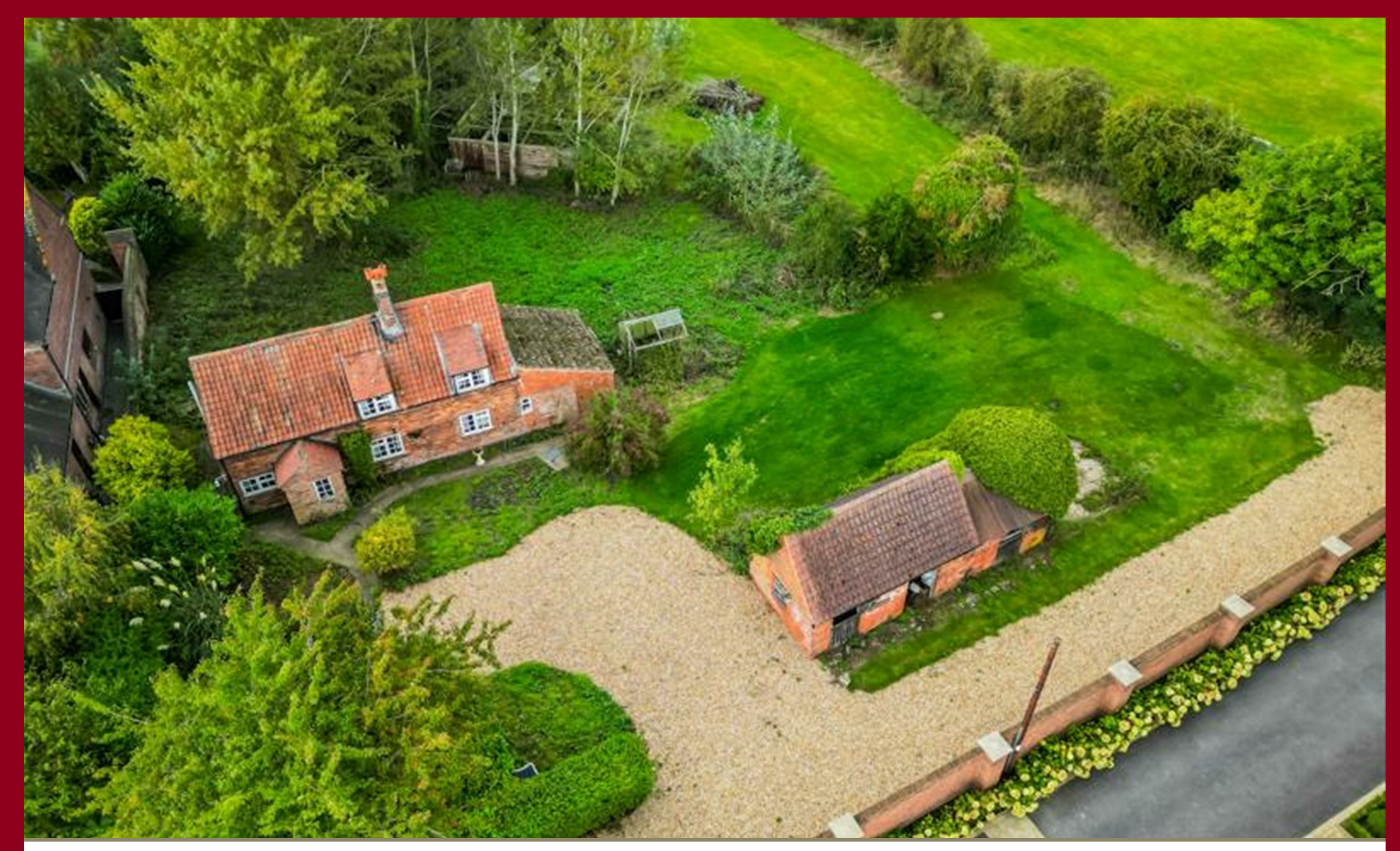
Rose Cottage Bathley Lane, Little Carlton, Newark, NG23 6BY