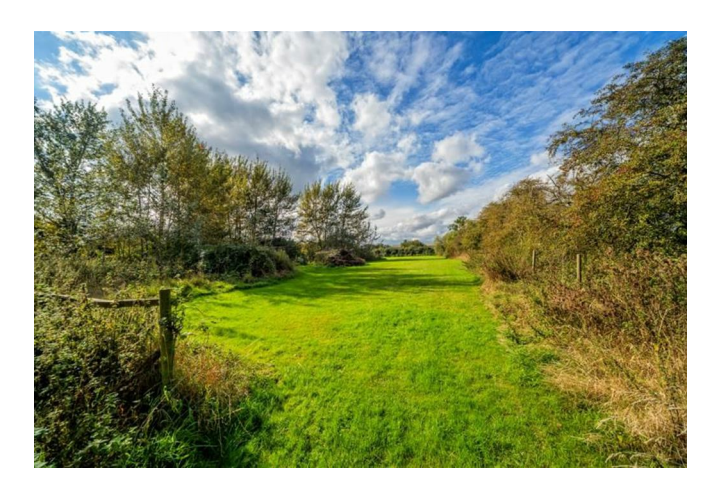
The grass paddock extends to the rear boundary, in all the property stands in 1.915 acres (0.775 hectares) or thereabouts.