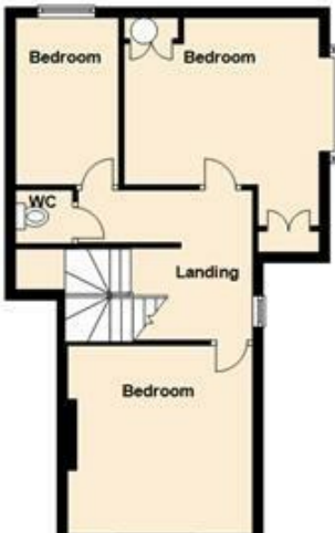
First Floor Approx. 46.3 sq. metres (497.9 sq. feet)