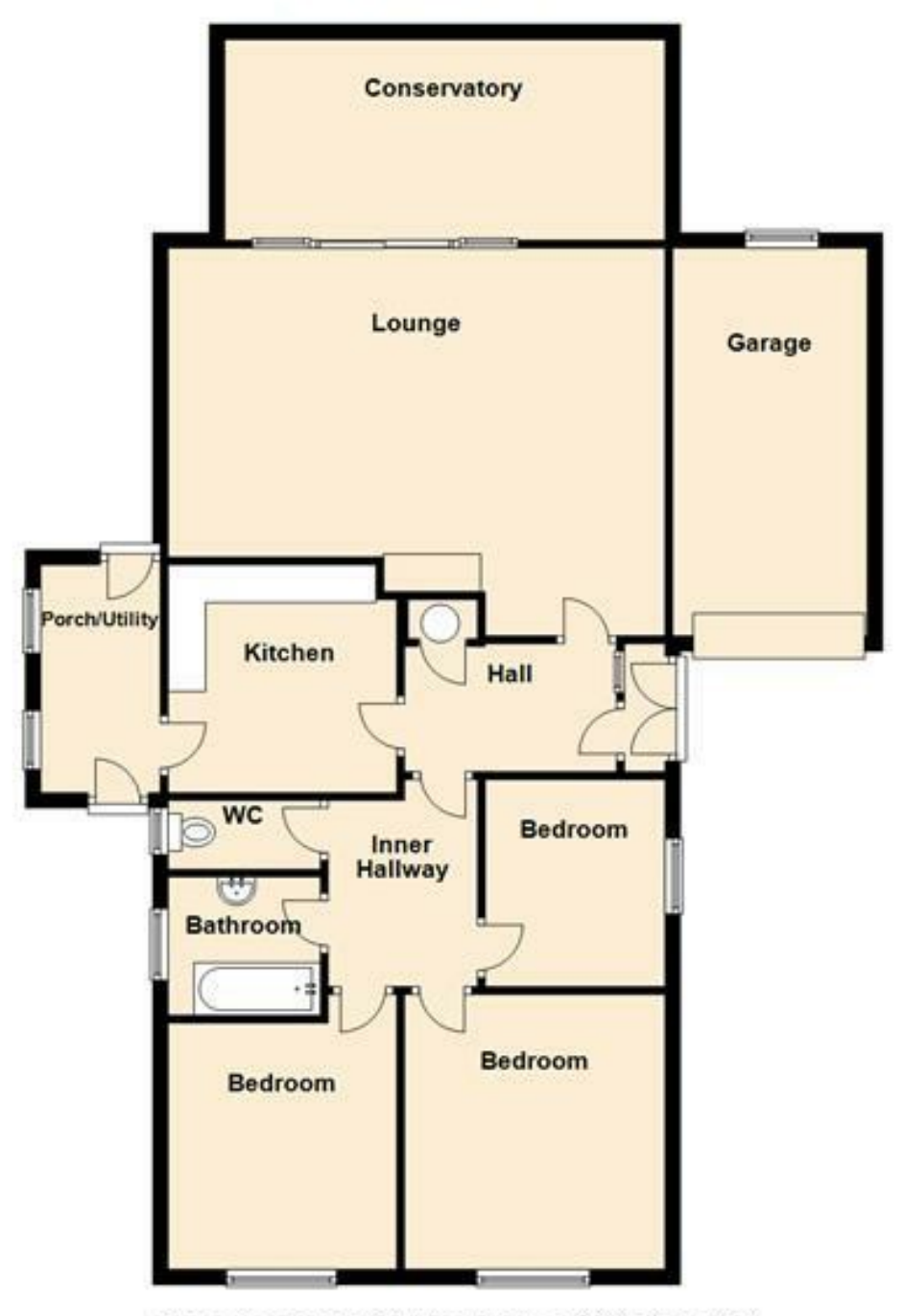
Floor Plan Approx. 106.9 sq. metres (1139.7 sq. feet)

Total area: approx. 105.9 sq. metres (1139.7 sq. feet)