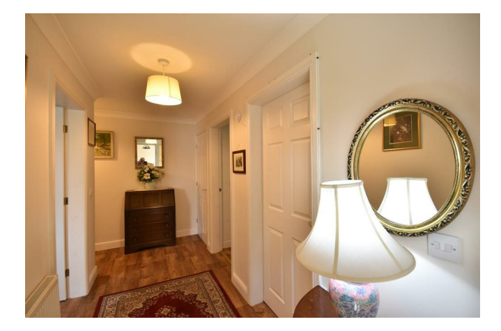
With laminate floor, radiator and broom cupboard.