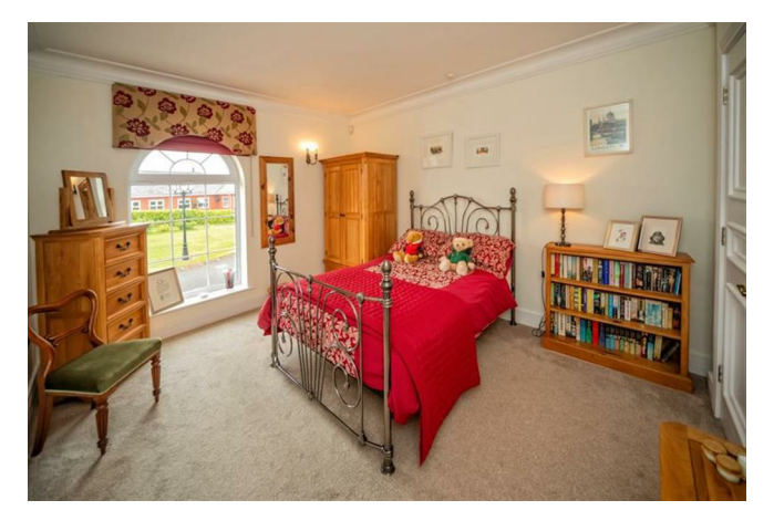
With feature arched uPVC double glazed windows to the front elevation, radiator, high ceiling with moulded ceiling cornice.