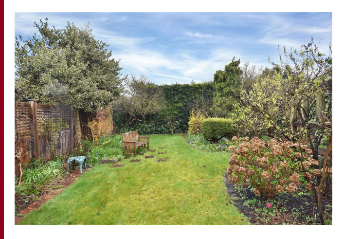
The cottage stands in a delightful town garden with a walled frontage, stone flagged and blue brick patio areas, various trees and a lawned area. The garden is very secluded.