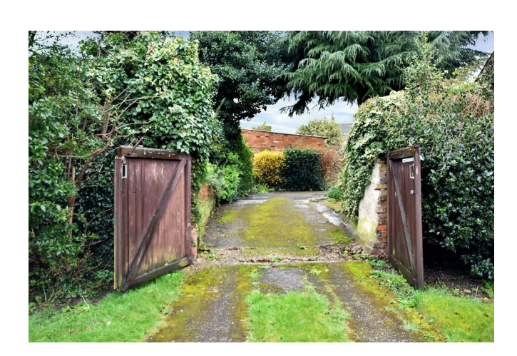
There is a back yard, blue brick paved, gate and pedestrian passageway through to Barnby Gate