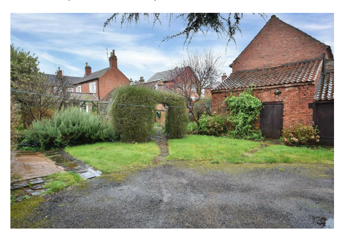
An adjoining building of brick construction under a pantiled roof.