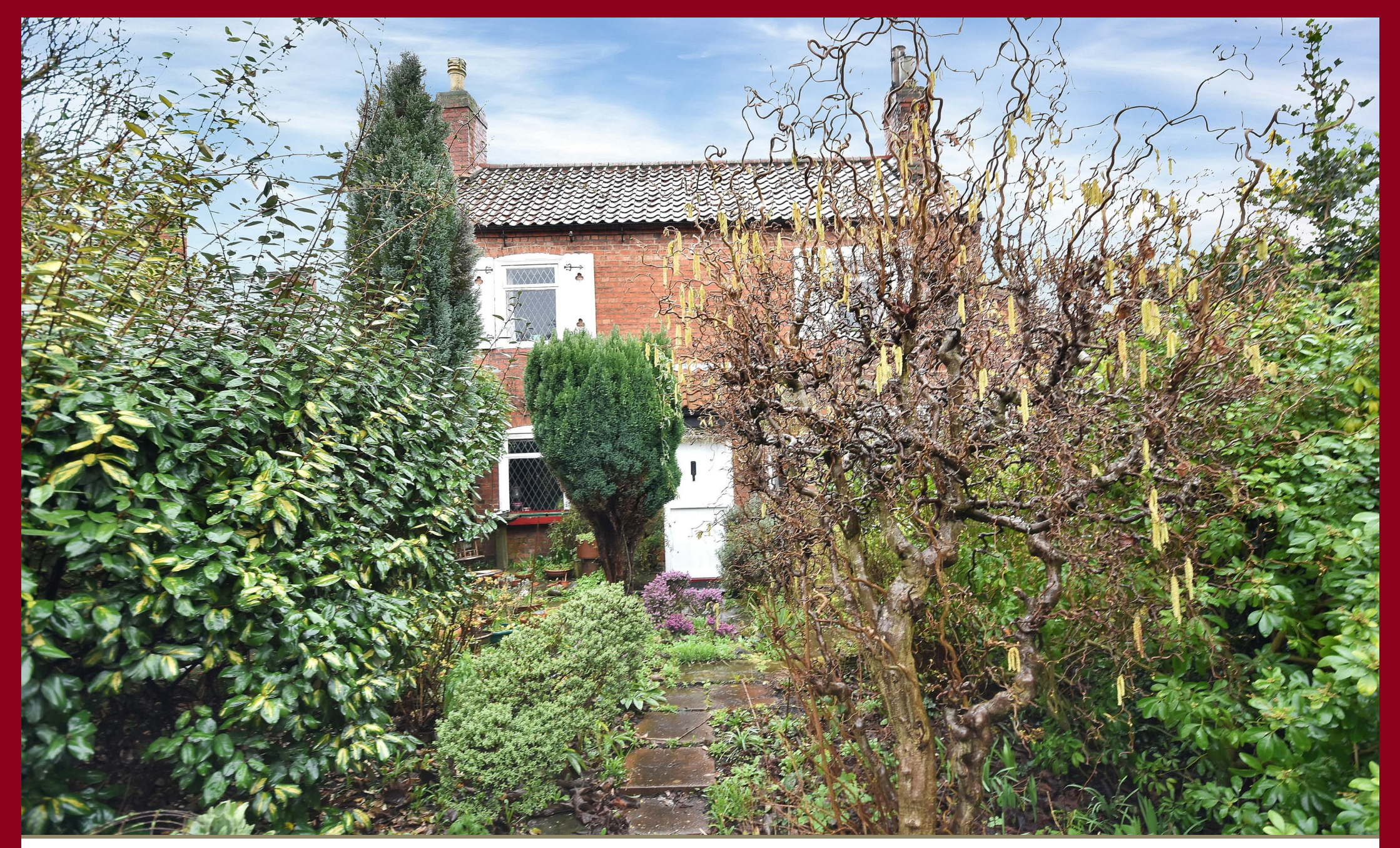
Flagg Cottage, 95 Barnby Gate, Newark, NG24 1QW