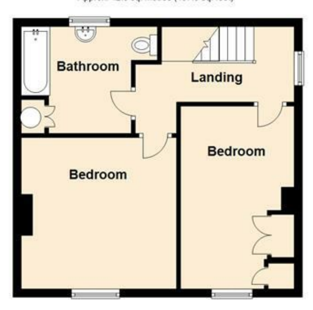
First Floor Approx. 42.5 sq. metres (457.5 sq. feet)