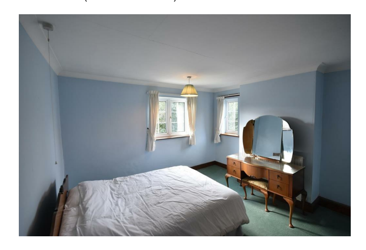
BEDROOM TWO 12'7 x 12'2 (3.84m x 3.71m)

With radiator and hatch to the roof space.