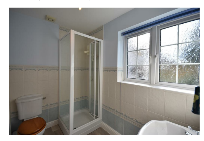
EN-SUITE 7'8 x 5'8 (2.34m x 1.73m)

Shower cubicle with electric shower, pedestal basin and low suite WC. Radiator, half tiled walls, extractor fan, fitted spotlights.