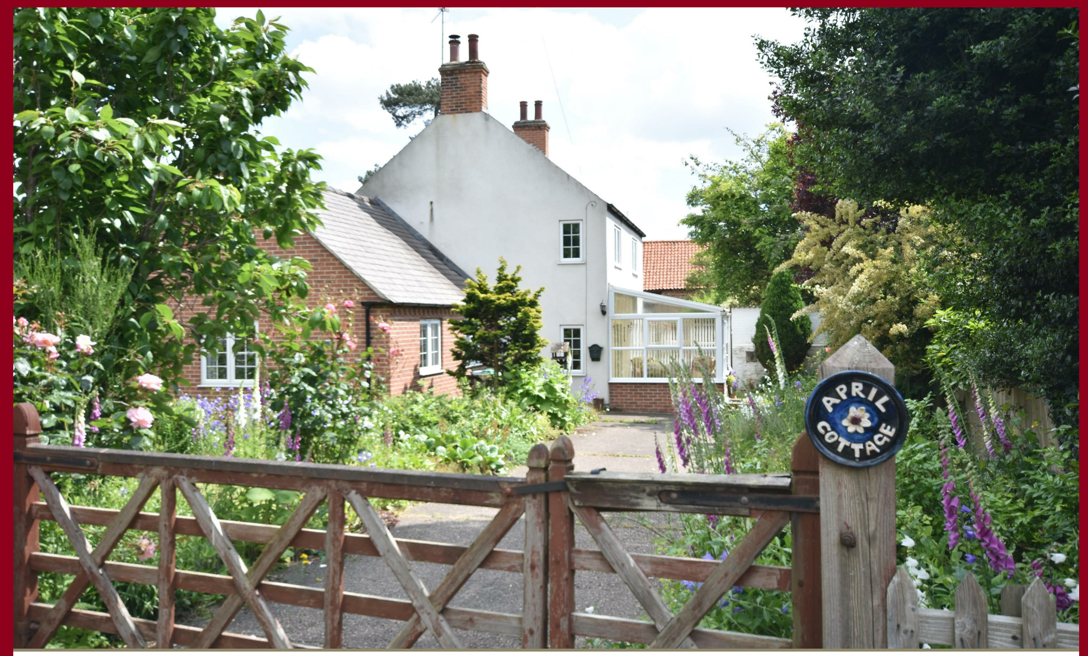
April Cottage Ferry Lane, Carlton-On-Trent, Newark, NG23 6NS