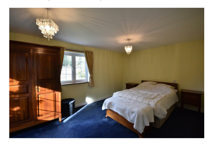
BEDROOM ONE 18'5 x 11'3 (5.61m x 3.43m)

UPVC rear entrance door, fitted base cupboards, integrated fridge/freezer, radiator, ceramic tiled floor, LED lighting, integrated washing machine and dishwasher.