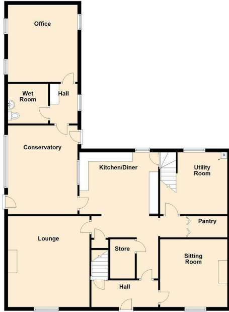
Ground Floor Approx. 134.3 sq. metres (1445.1 sq. feet)

Total area: approx. 269.0 sq. metres (2895.6 sq. feet)