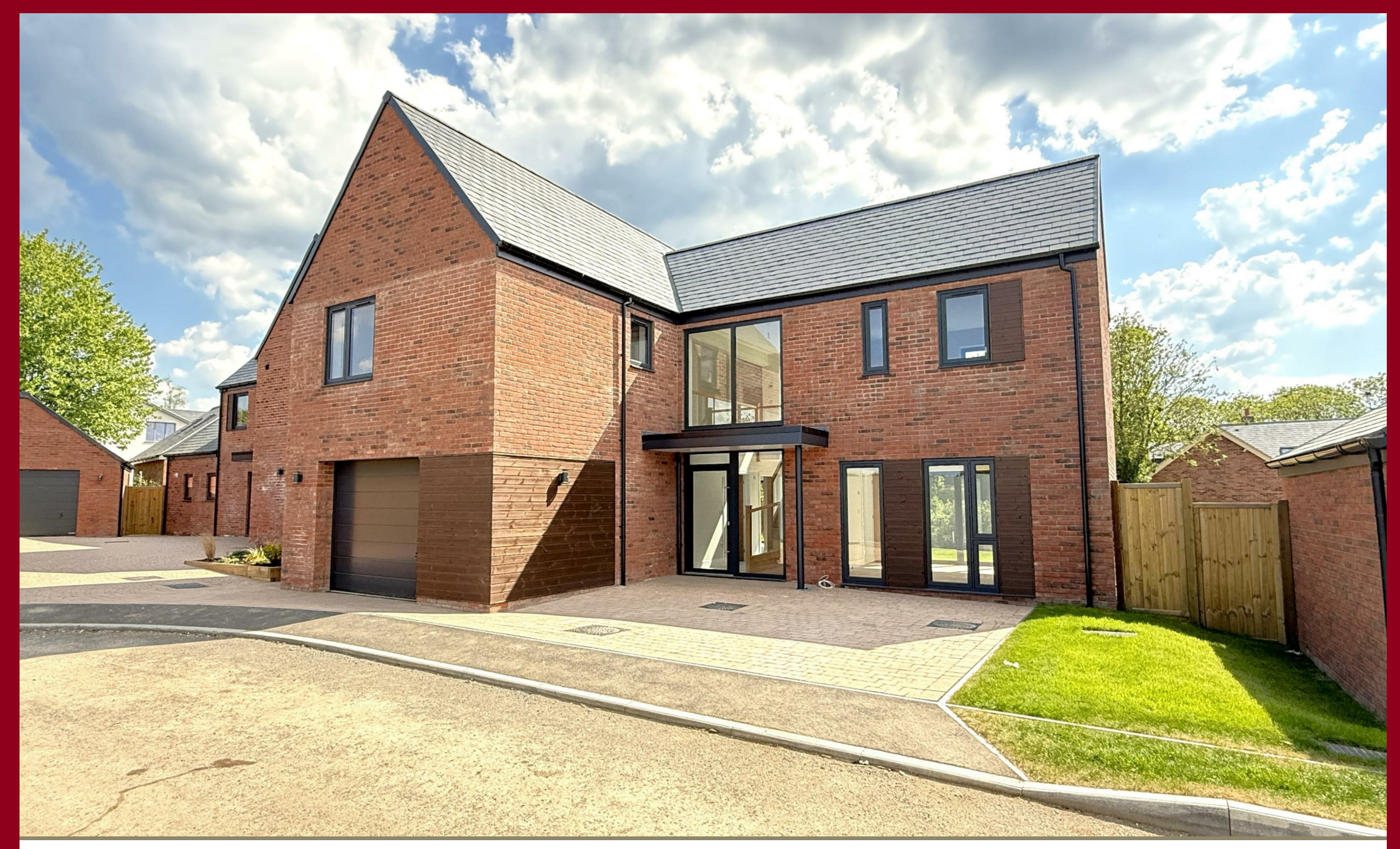
Plot 16, Regansfield Meadows Lane, Hose, Leicestershire, LE14 4JH