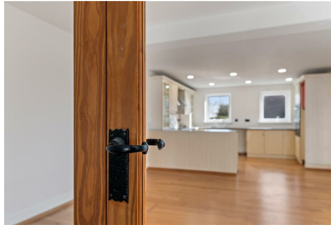
LIVING/DINING KITCHEN 24'6" x 13'3" (7.47m x 4.04m)