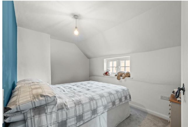
BEDROOM 2 11'8" x 7'11" (3.56m x 2.41m)

A further double bedroom having part pitched ceiling, chimney breast with alcove to the side, central heating radiator and double glazed window.