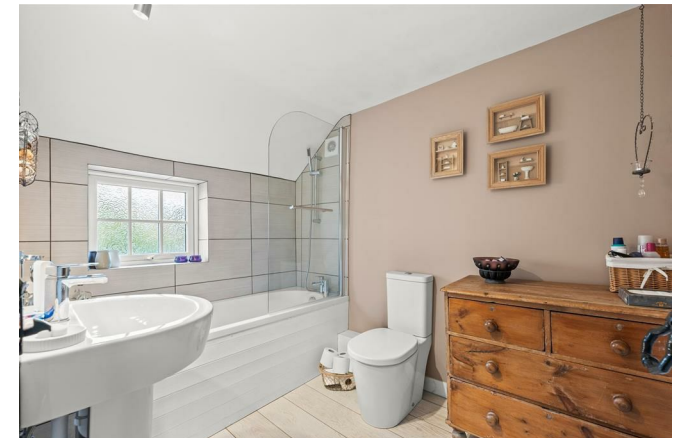
BATHROOM 8'6" x 6' (2.59m x 1.83m)

Tastefully appointed with a contemporary suite comprising panelled bath with chrome mixer tap with integrated shower handset and glass screen, close coupled WC and pedestal washbasin with contemporary tiled splash backs, central heating radiator and double glazed window.