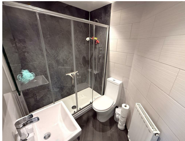
SHOWER ROOM 7'11" max x 5'8" max (2.41m max x 1.73m max)

Appointed with a contemporary suite comprising large double width shower enclosure with sliding screen and wall mounted shower mixer with both independent