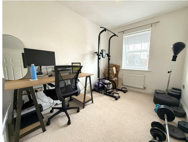
BEDROOM 2 9'10" x 8' (3.00m x 2.44m)

A further double bedroom having central heating radiator and double glazed window.