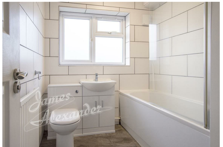
Bathroom 8'2" x 6'6" (2.50 x 2.00)