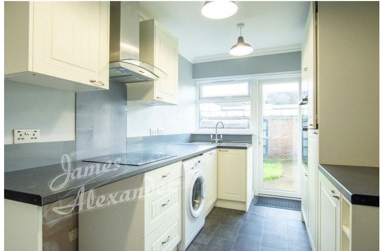
Kitchen 13'9" x 7'6" (4.20 x 2.30)