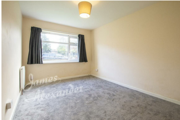
Bedroom 1 13'5" x 9'6" (4.10 x 2.90)