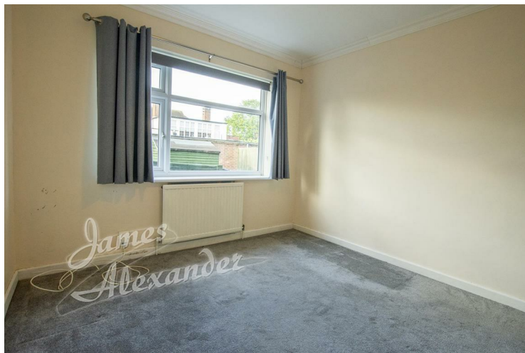
Bedroom 2 10'2" x 9'10" (3.10 x 3.00)