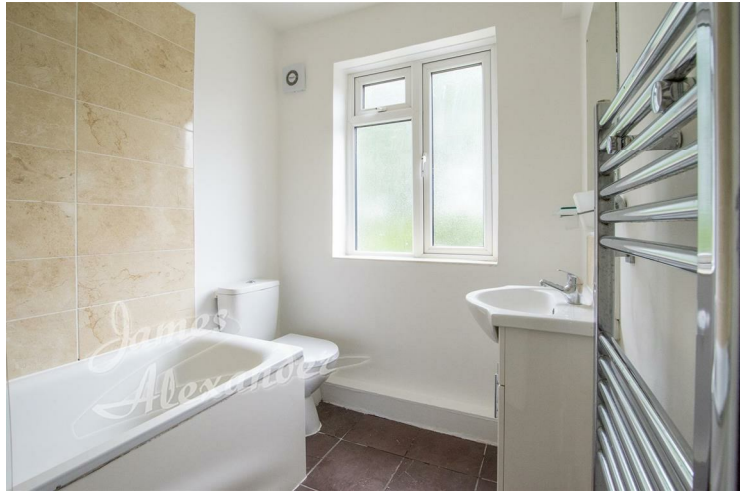
Bathroom 7'6" x 5'10" (2.30 x 1.80)