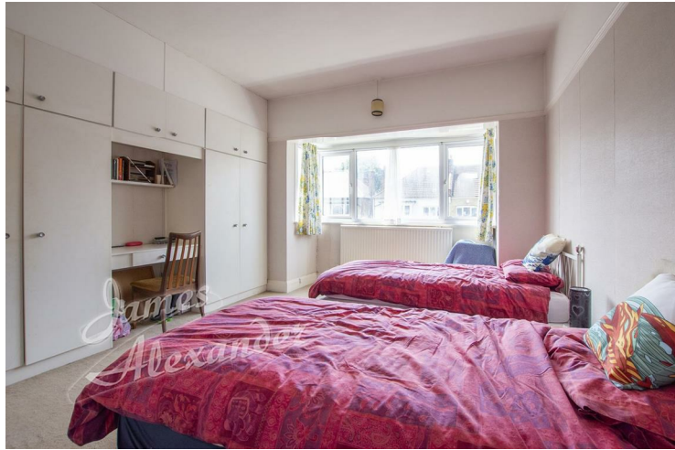
Bedroom 1 14'9" x 12'9" (4.50 x 3.90)