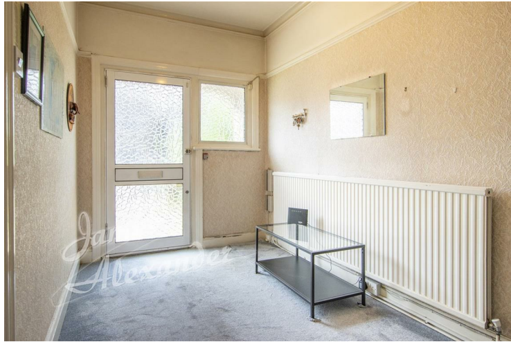
Reception 3 11'5" x 10'2" (3.50 x 3.10)