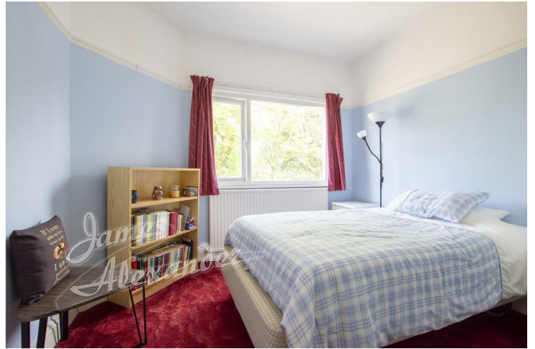
Bedroom 4 12'1" x 8'10" (3.70 x 2.70)