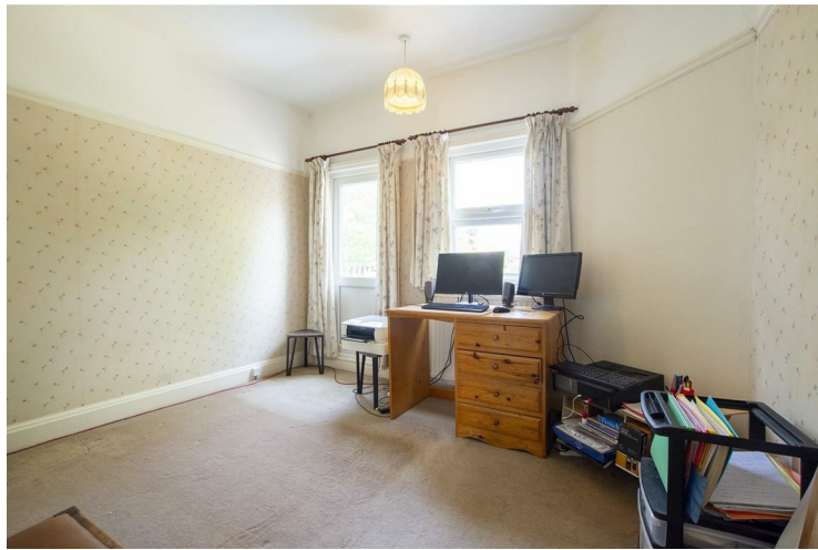
Bedroom 2 12'1" x 11'5" (3.70 x 3.50)