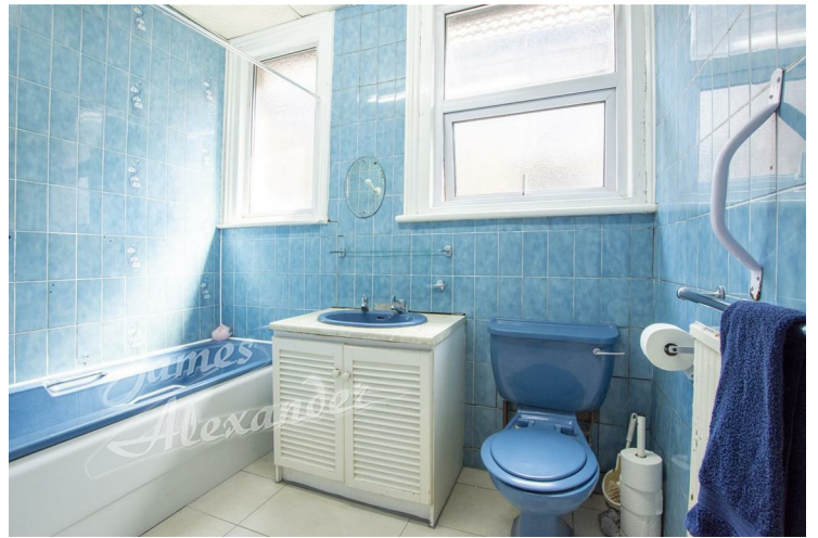
Bathroom 7'10" x 7'10" (2.40 x 2.40)