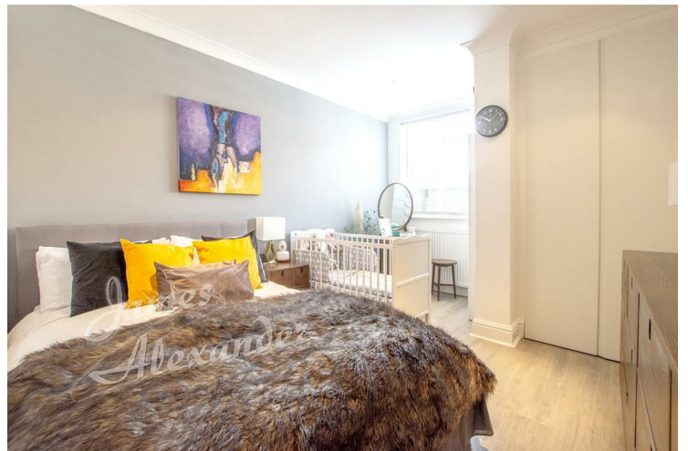
Bedroom 13'1" x 10'2" (4.0 x 3.10)