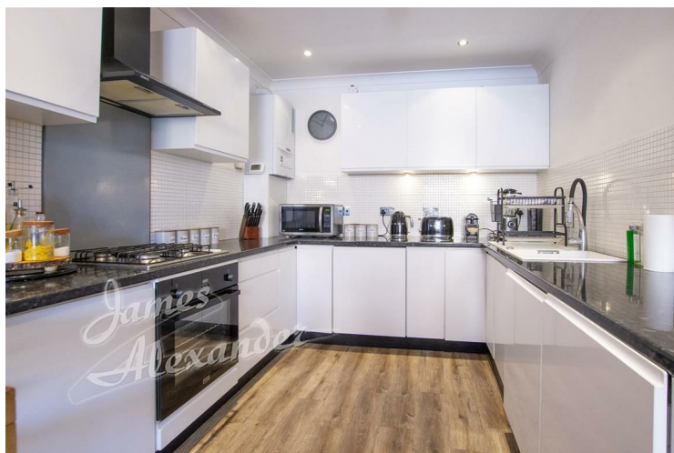
Kitchen 9'6" x 8'10" (2.90 x 2.70)