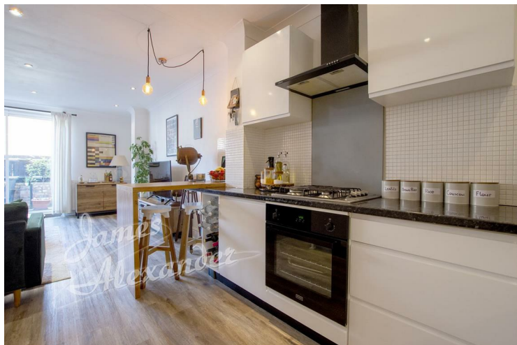
Kitchen second aspect