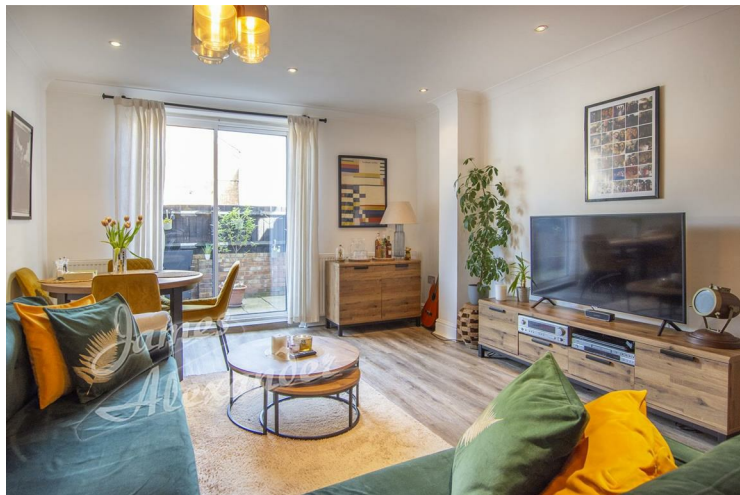
Reception 16'8" x 12'9" (5.10 x 3.90)