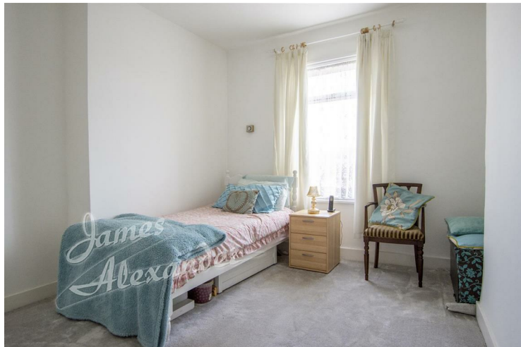
Bedroom 2 12'5" x 11'1" (3.8 x 3.4)