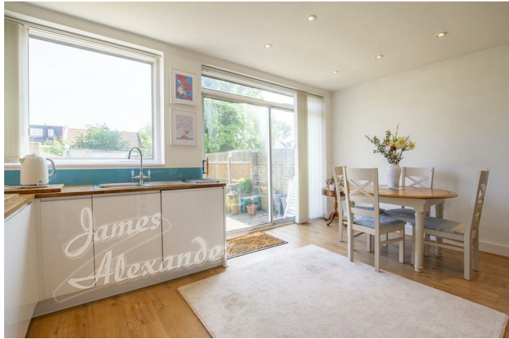
Kitchen diner alt aspect