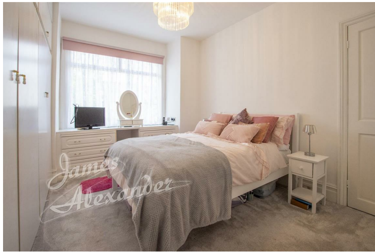
Bedroom 1 13'5" x 11'1" (4.1 x 3.4)