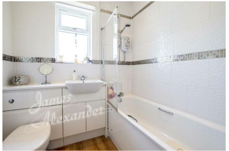
Bathroom 6'2" x 5'10" (1.9 x 1.8)