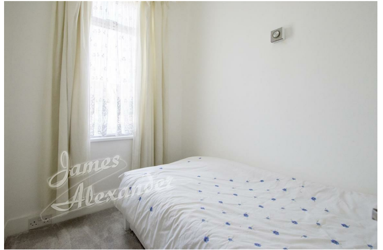
Bedroom 3 7'10" x 5'2" (2.4 x 1.6)