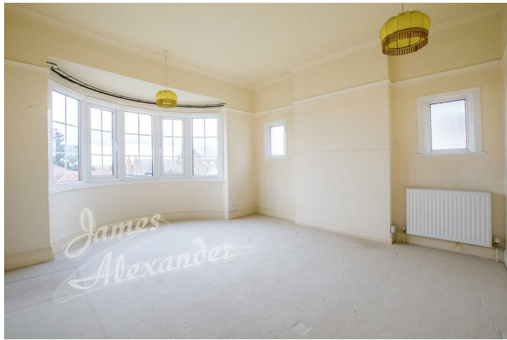
Bedroom 4 8'10" x 7'10" (2.7 x 2.4)