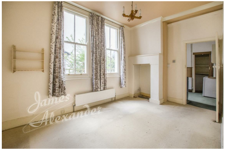
Reception 3 14'1" x 8'10" (4.3 x 2.7)