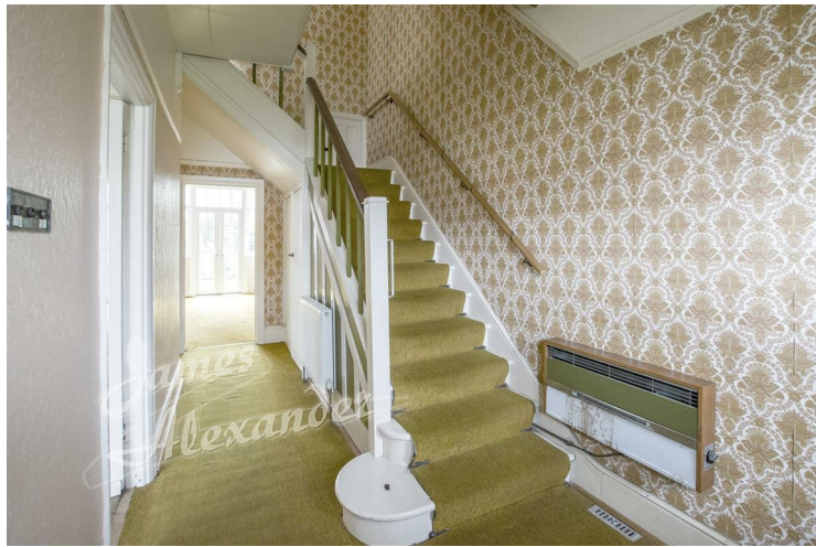
Entrance alt view