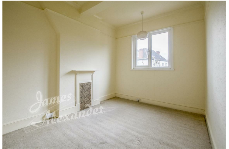
Bedroom 3 12'9" x 8'10" (3.9 x 2.7)