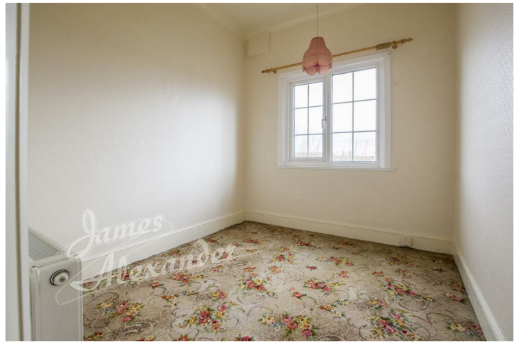
Bedroom 4 8'10" x 7'10" (2.7 x 2.4)