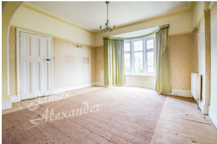
Reception 1 18'0" x 13'9" (5.5 x 4.2)