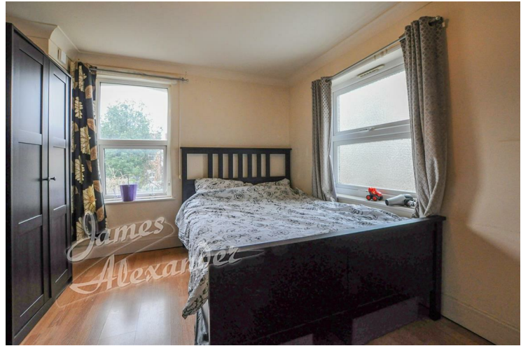
Bedroom 2 11'1" x 9'10" (3.4 x 3)