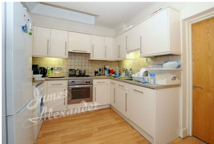
Kitchen 9'10" x 8'10" (3 x 2.7)