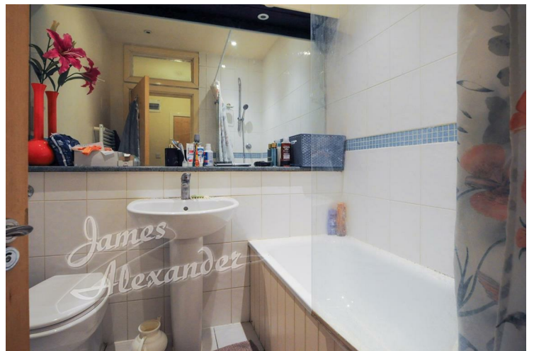
Bathroom 6'6" x 6'2" (2 x 1.9)