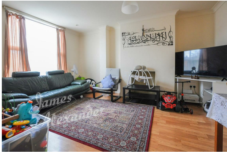
Reception 15'1" x 10'9" (4.6 x 3.3)