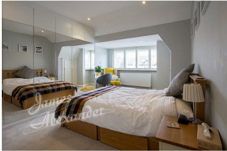
Bedroom 1 19'0" x 12'1" (5.80 x 3.70)