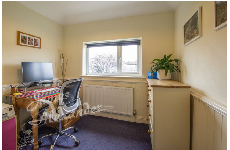
Bedroom 4 9'6" x 8'10" (2.90 x 2.70)