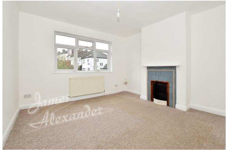
Bedroom 1 11'9" x 11'9" (3.6 x 3.6)