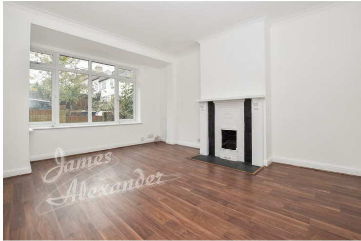
Reception 1 14'5" x 12'1" (4.4 x 3.7)