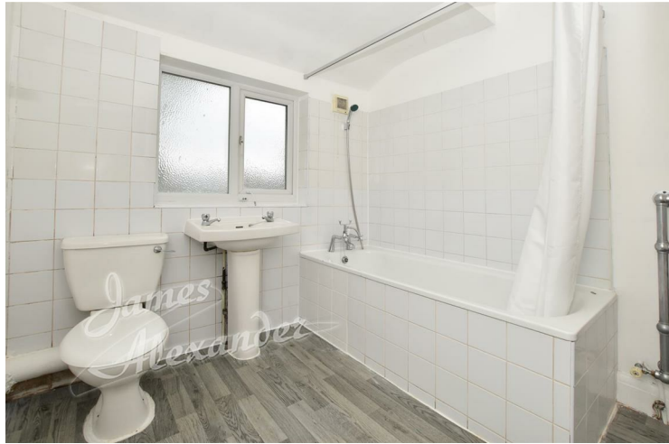
Bathroom 7'2" x 6'6" (2.2 x 2)