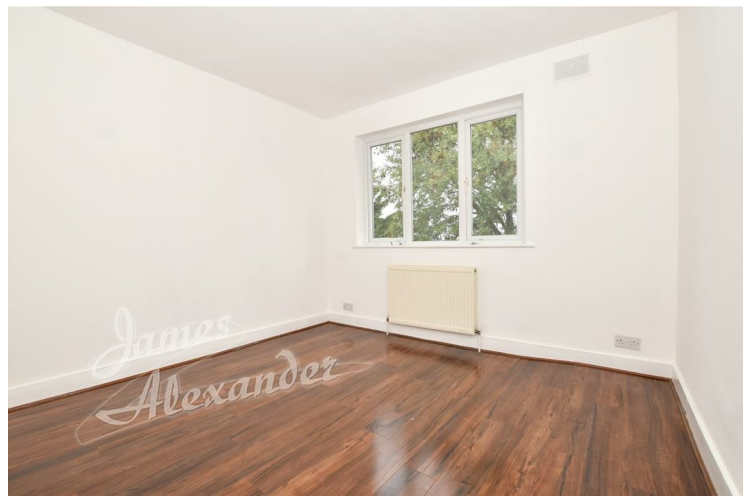
Bedroom 2 10'9" x 10'5" (3.3 x 3.2)