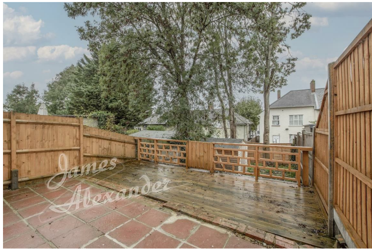
Garden 52'5" x 19'4" (16 x 5.9)