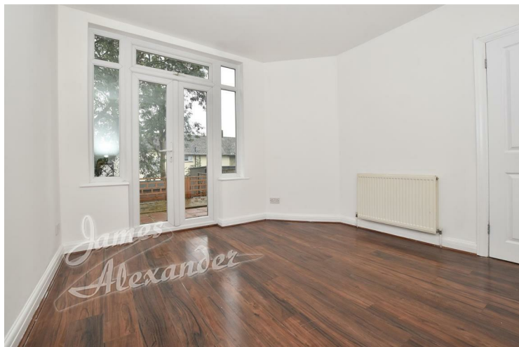
Reception 2 11'5" x 10'5" (3.5 x 3.2)