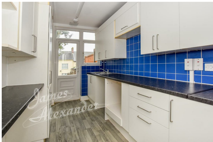
Kitchen 11'9" x 6'10" (3.6 x 2.1)