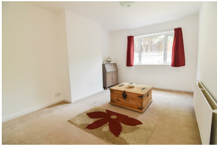
Reception 1 15'5" x 10'9" (4.70 x 3.30)