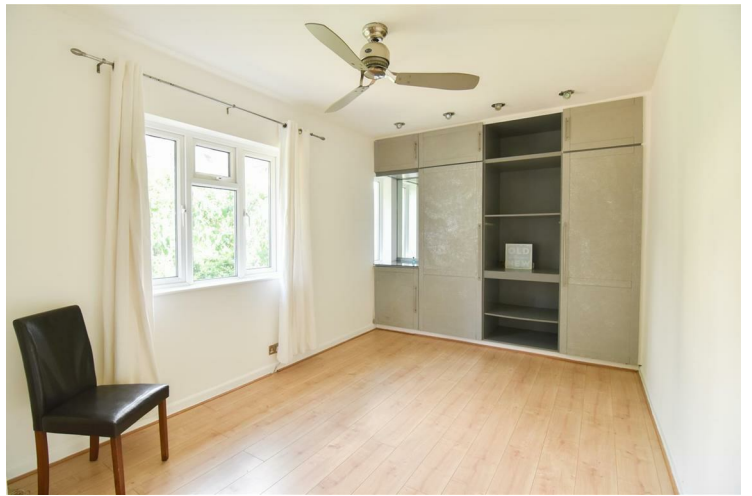
Bedroom 1 14'1" x 9'10" (4.30 x 3.00)