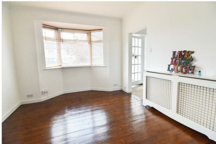
Reception 2 12'5" x 10'5" (3.80 x 3.20)