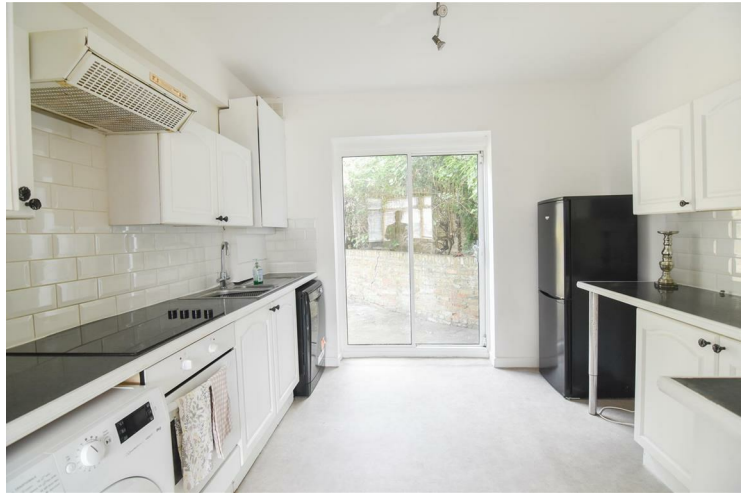
Kitchen 10'5" x 10'5" (3.20 x 3.20)