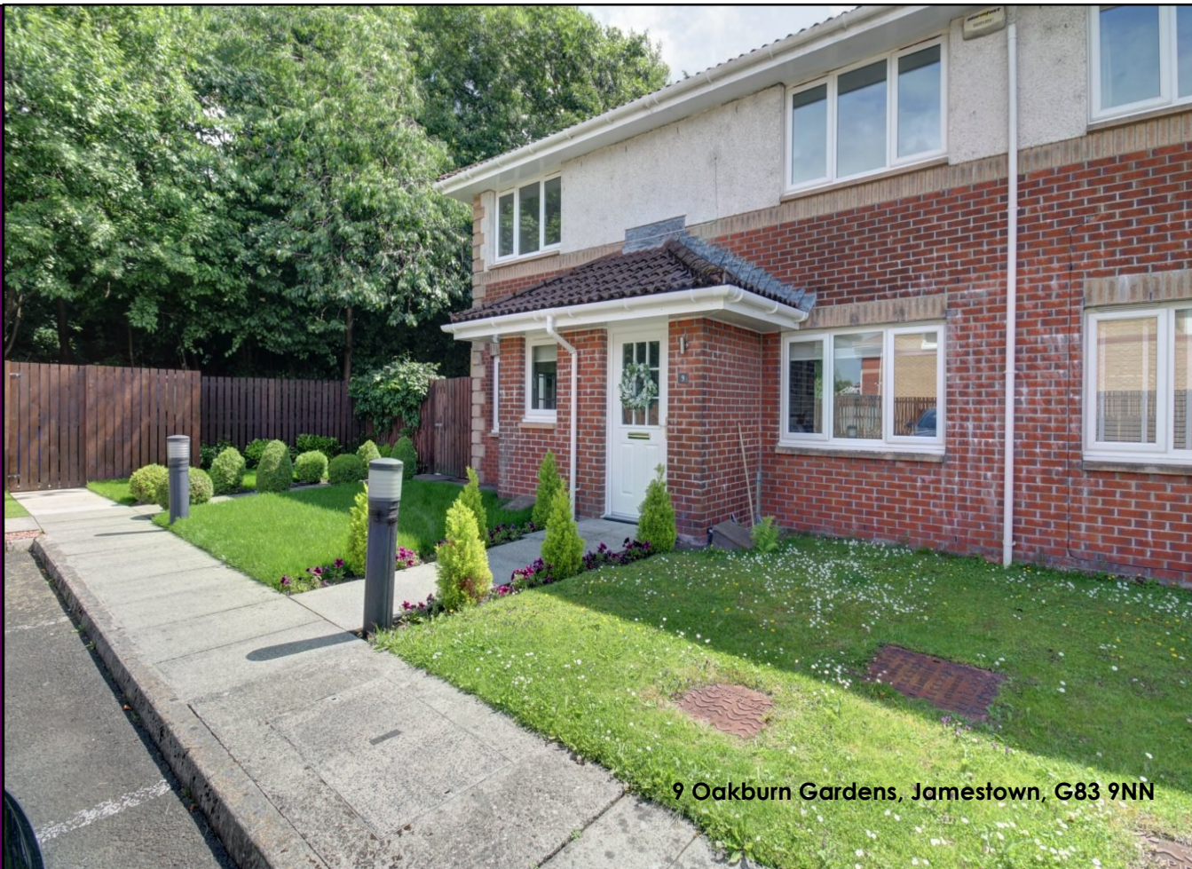
9 Oakburn Gardens, Jamestown, G83 9NN

This seldom available modern two-bedroom first floor flat is presented to the market in true walk-in condition. This immaculate property is situated in the desirable, select and private Oakburn Gardens development and will be of interest to a wide range of buyers including young couples, downsizers and first-time buyers.