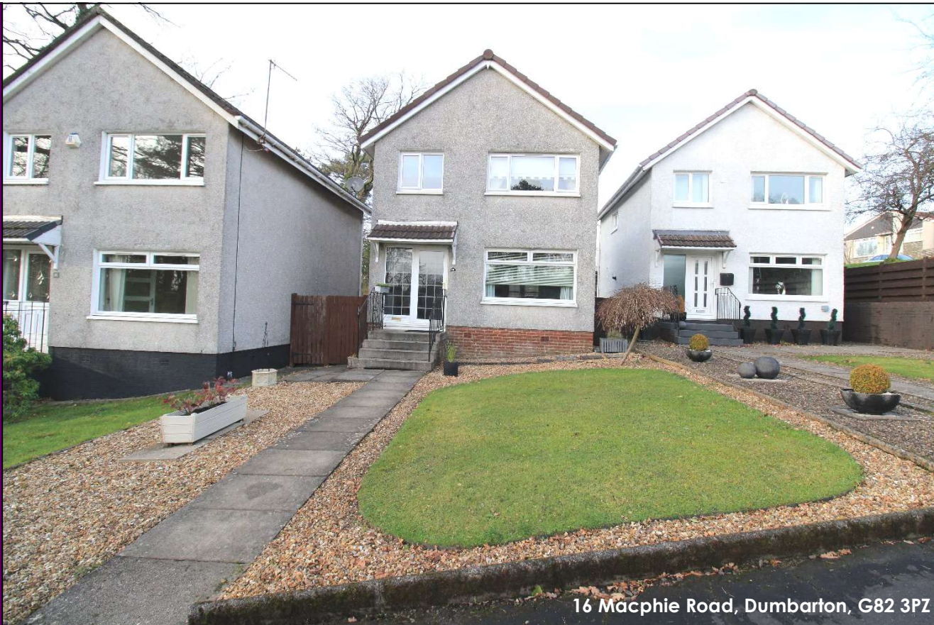
16 Macphie Road, Dumbarton, G82 3PZ

Well presented and maintained 3 bedroom detached villa set within the ever popular address of MacPhie Road, High Overtoun Estate. The accommodation comprises, reception hall with deep under stairs storage, spacious living room with open plan dining, smart kitchen, 3 generous size bedrooms and deluxe family bathroom.