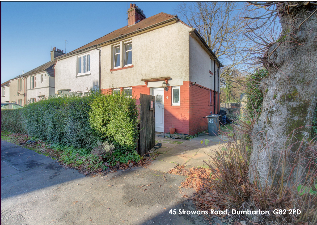
45 Strowans Road, Dumbarton, G82 2PD

Situated within the highly sought-after Silverton Estate, this three-bedroom semi-detached villa presents a fantastic opportunity for buyers looking to add value. The property offers generous living space, including a lounge, kitchen, bathroom, and three well-proportioned bedrooms, making it an ideal layout for family living.