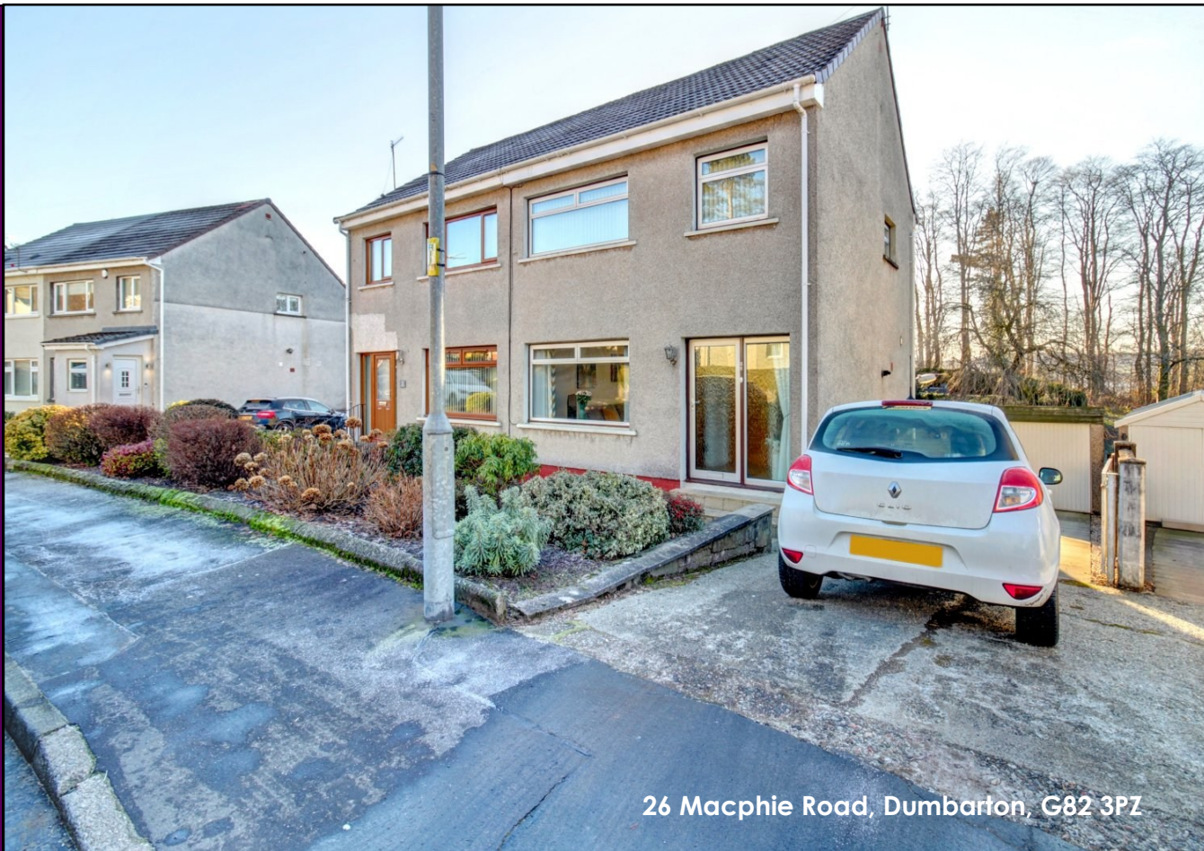
26 Macphie Road, Dumbarton, G82 3PZ

A well-presented three-bedroom semi-detached villa located within the ever-popular High Overtoun Estate. Offering generous accommodation, excellent outdoor space and modern comforts, this property is ideal for families and those seeking a home in a desirable residential setting.