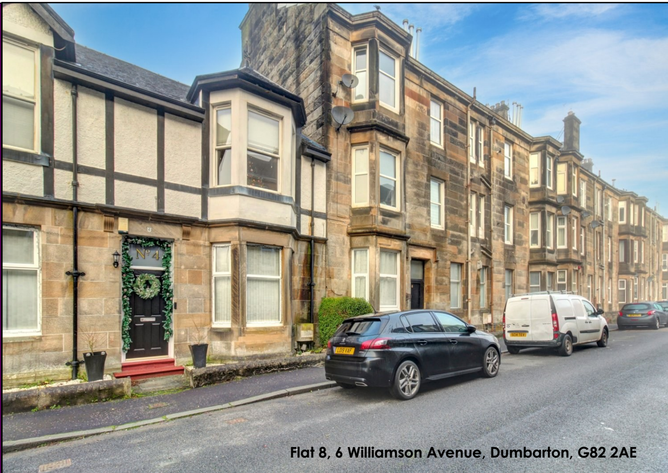
Flat 8, 6 Williamson Avenue, Dumbarton, G82 2AE

A well-presented one-bedroom top-floor flat forming part of a traditional tenement block on ever-popular Williamson Avenue, this property offers generous proportions, classic period charm and superb convenience. Ideally positioned close to a wide range of local amenities and excellent public transport links.