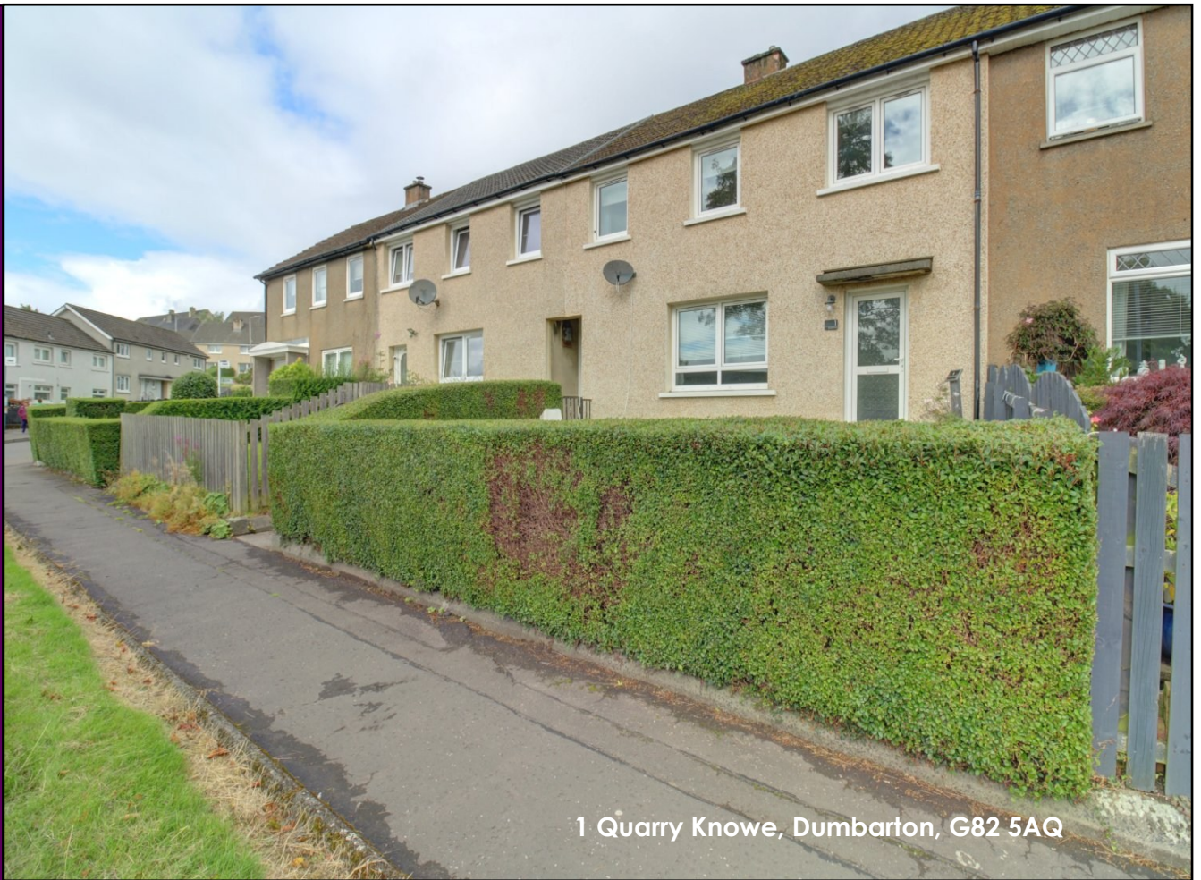
1 Quarry Knowe, Dumbarton, G82 5AQ

The agent offers to the market this spacious three-bedroom mid-terrace villa which is located in the popular Castlehill Estate, close to local schooling, shops and public transport links.