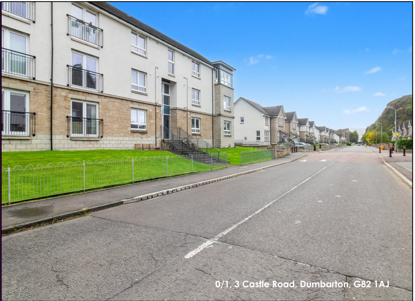
0/1, 3 Castle Road, Dumbarton, G82 1AJ

Offered to the market in pristine condition this luxury modern two-bedroom ground floor flat forms part of the impressive Castle Point development built by the renowned Turnberry Homes. This generously proportioned luxury apartment benefits from secure entry system, carpeted foyer and private resident and visitor parking facilities.