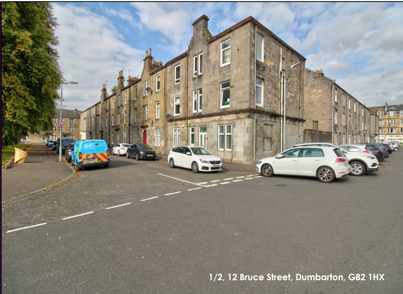
1/2, 12 Bruce Street, Dumbarton, G82 1HX

David Muir Estate Agents present to the market this well-presented two-bedroom first floor flat which forms part of a traditional tenement block, in the popular East end of town, close to shops, schooling and public transport links.