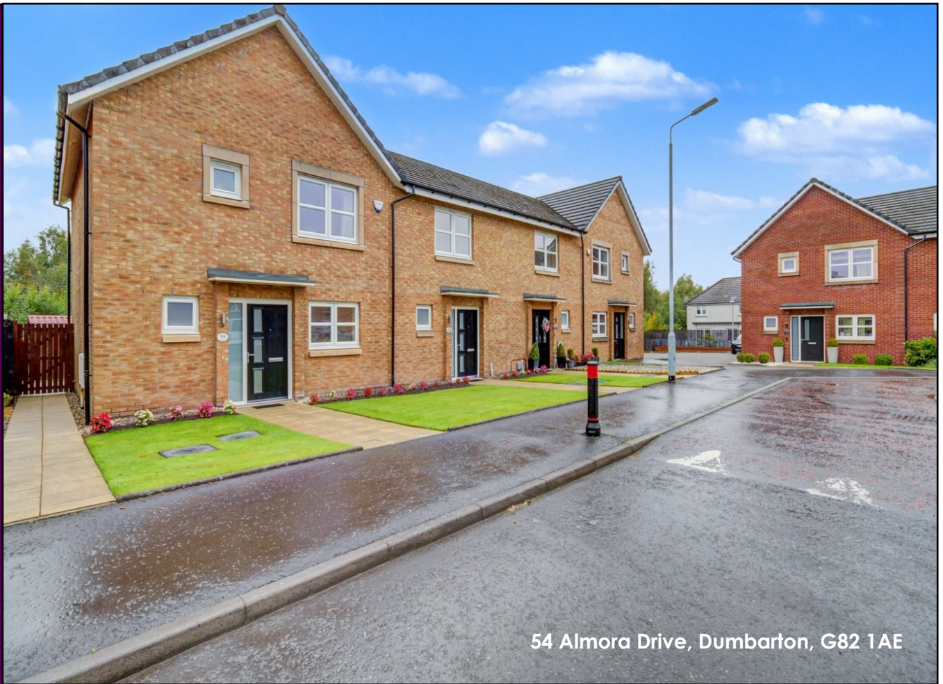
54 Almora Drive, Dumbarton, G82 1AE

David Muir Estate Agents offer to the market this well-presented three-bedroom end-terrace villa, which is located within the sought-after Appleton Park Estate. The property offers instant kerb appeal with an immaculate front garden comprising of manicured lawn and regimented flower beds.