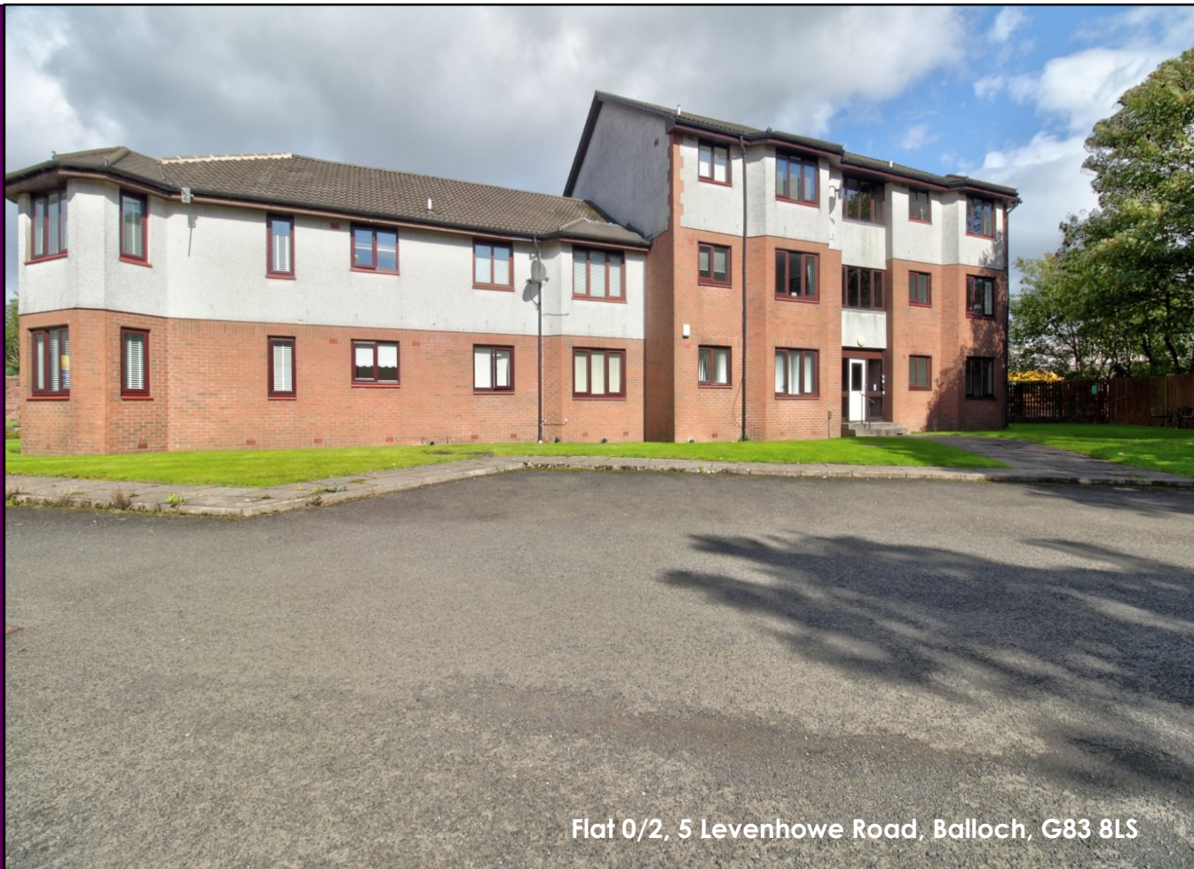
Flat 0/2, 5 Levenhowe Road, Balloch, G83 8LS

The agent offers to the market this two-bedroom ground floor flat which is located in a popular residential street at the edge of Balloch, and just a short walk into the village where you'll find a good selection of shops, bars, restaurants and public transport links including regular trains into Glasgow.