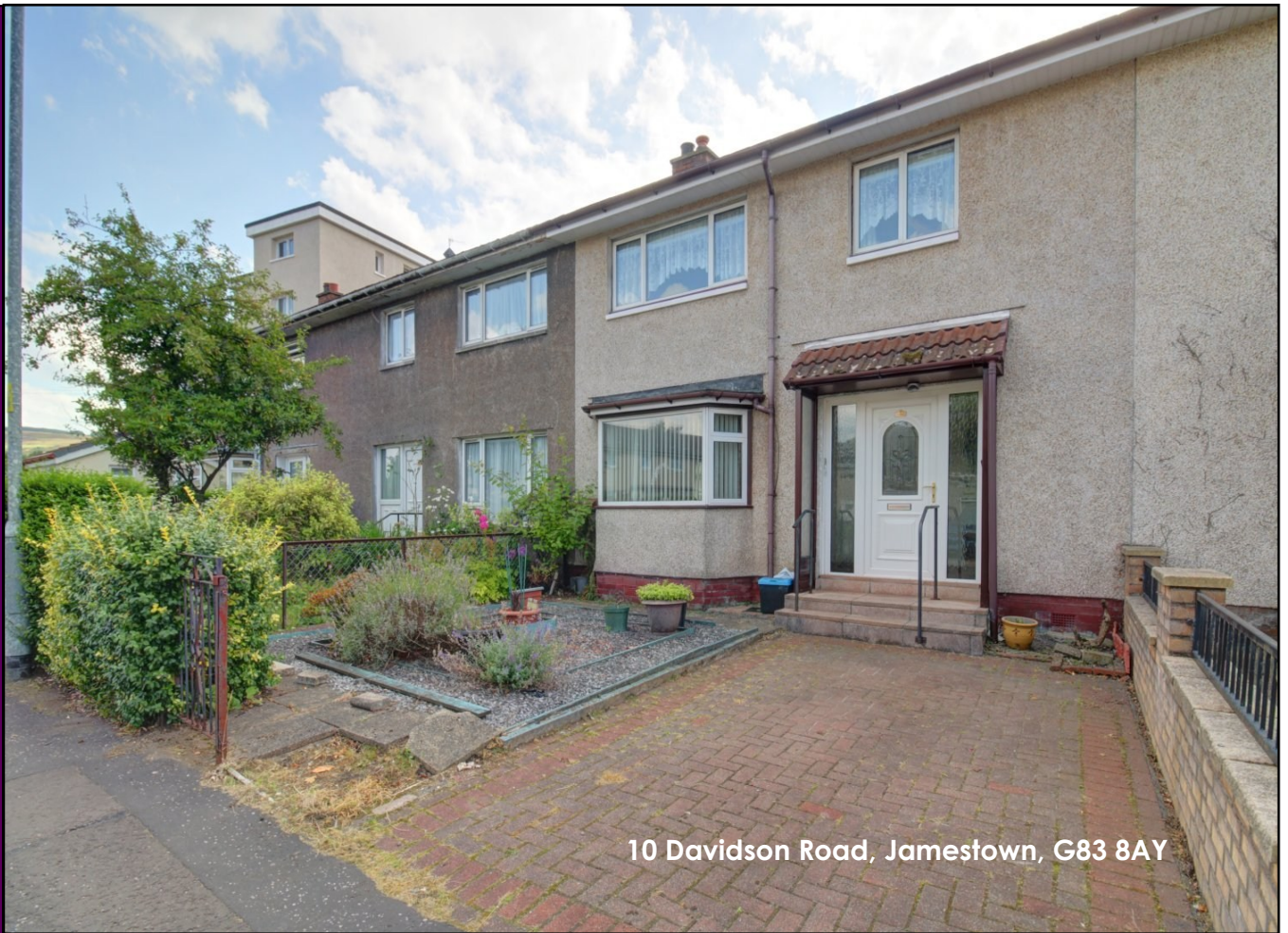
10 Davidson Road, Jamestown, G83 8AY

This spacious three-bedroom mid-terrace villa sits in a good-sized plot and is situated within walking distance to shops, Balloch Campus primary school and Balloch village centre. The property will need a degree of upgrading works throughout, which is reflected in the price, but will make an excellent family home when completed.