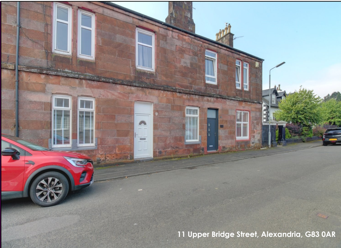
11 Upper Bridge Street, Alexandria, G83 0AR

This well-presented main door two-bedroom apartment forms part of a traditional red sandstone block and is located in a much sought after area of Alexandria, just a short distance to, shops, local schooling and public transport links.