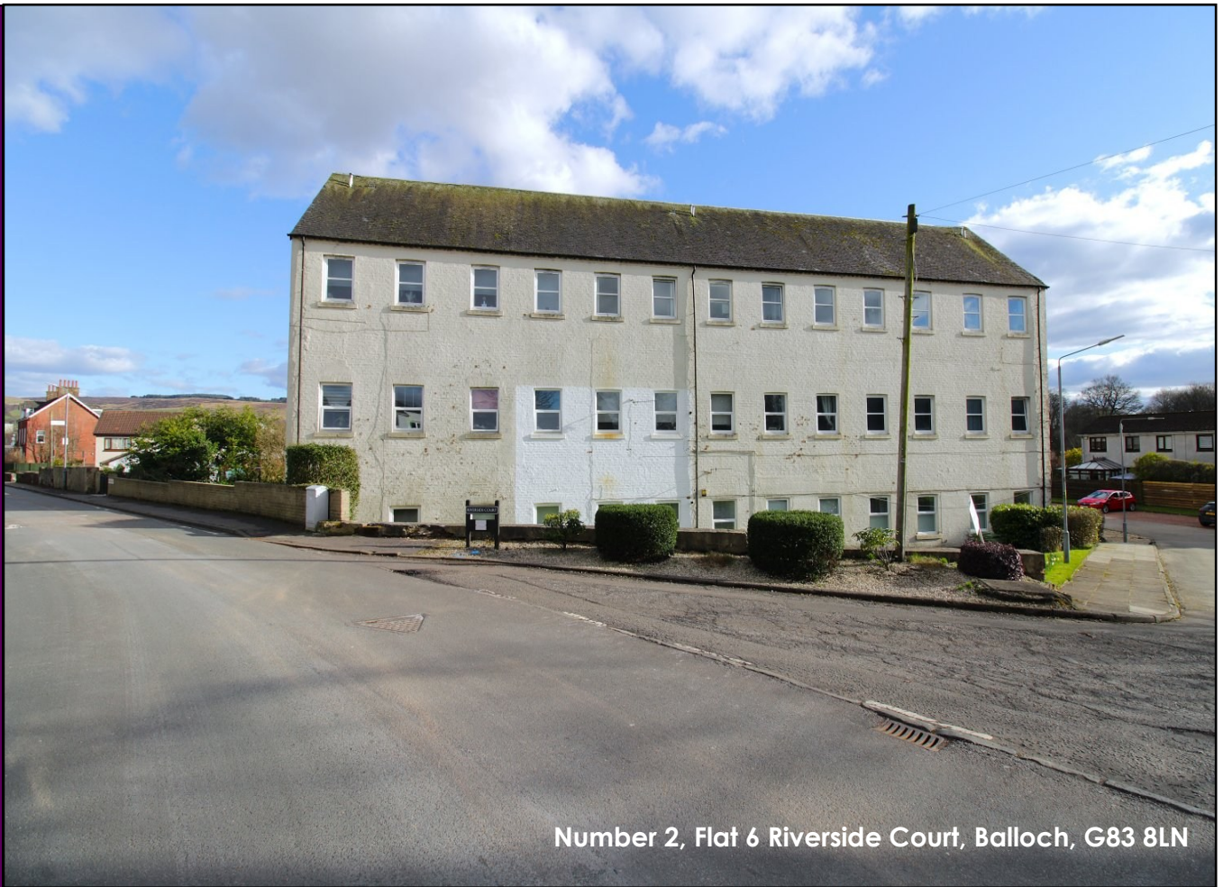
Number 2, Flat 6 Riverside Court, Balloch, G83 8LN

David Muir Estate Agents offer to the market this two-bedroom first floor flat which is conveniently located within walking distance to shops, schools and Balloch train station.