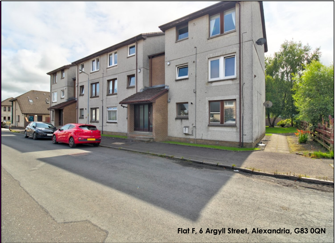
Flat F, 6 Argyle Street, Alexandria, G83 0QN

David Muir Estate Agents offer to the market this well-presented two-bedroom top floor flat which is located in Levenvale, which sits between Alexandria and Balloch town centres.