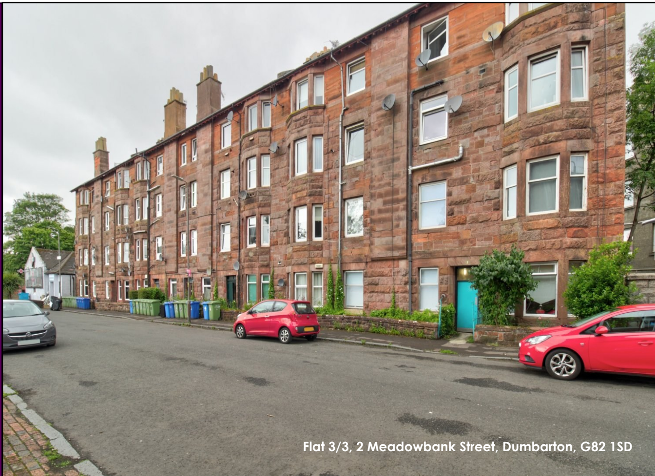
Flat 3/3, 2 Meadowbank Street, Dumbarton, G82 1SD

Accommodation of this fantastic property comprises entrance hallway, spacious bay window lounge, modern kitchen which has a range of base and wall units, plenty of worktop space and integrated oven and hob. The double bedroom has plenty of room for free standing furniture and a storage cupboard which houses the boiler. The bathroom has a white three-piece suite with electric shower over the bath. The specification of the property includes gas central heating, double-glazed windows and traditional features throughout. Externally, there are communal gardens to the rear.