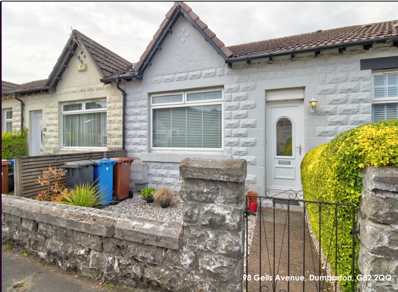
98 Geils Avenue, Dumbarton, G82 2QQ

Located in the ever-popular Dumbarton East address of Geils Avenue this stunning two-bedroom mid terrace cottage offers deceivingly spacious accommodation and is sure to attract significant interest.