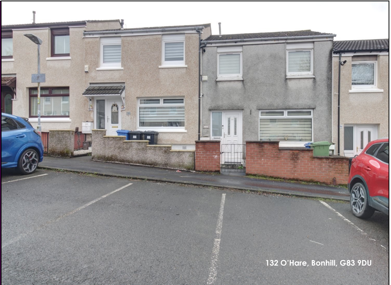
132 O'Hare, Bonhill, G83 9DU

David Muir Estate Agents offer to the market this three-bedroom mid-terrace which is set within a quiet cul de sac in the O'Hare Estate and provides excellent family accommodation over two levels.