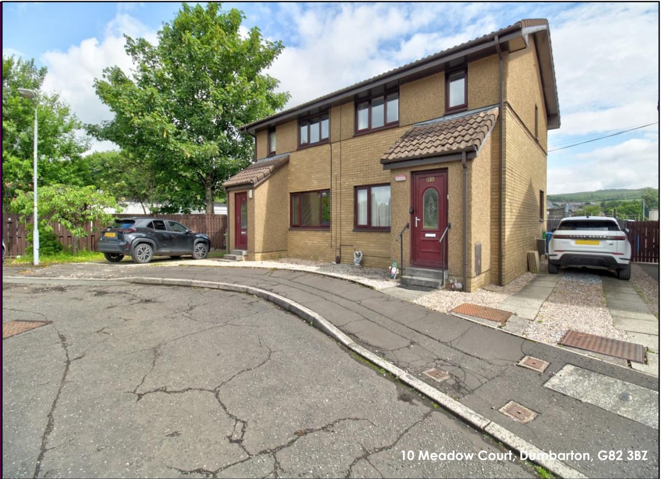
10 Meadow Court, Dumbarton, G82 3BZ

David Muir Estate Agents offer to the market this well-presented 3 bedroom semi-detached villa, which is located in this popular residential estate, within walking distance to the town centre, sports facilities, schools and public transport links.