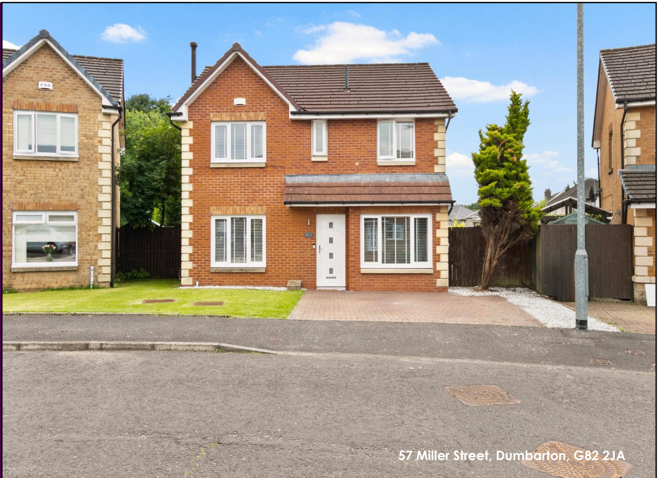
57 Miller Street, Dumbarton, G82 2JA

Stunning 4-Bedroom Detached Villa on a Sunny Corner Plot. Discover this beautifully extended, four-bedroom detached villa occupying a rare south-facing corner position. Meticulously maintained by its owners, this family home marries generous living spaces with top-tier finishes - no detail has been overlooked.